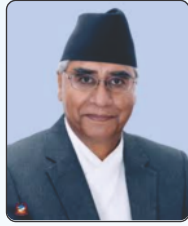
Rt. Hon'ble Sher Bhaadur Deupa Prime Minister