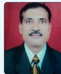
Toyaraj Bhatt Kailali Multiple Campus