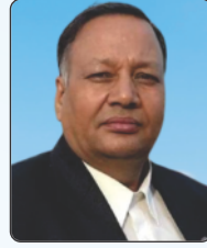
Hon'ble Devedra Paudel Minister, Education, Science and Technology